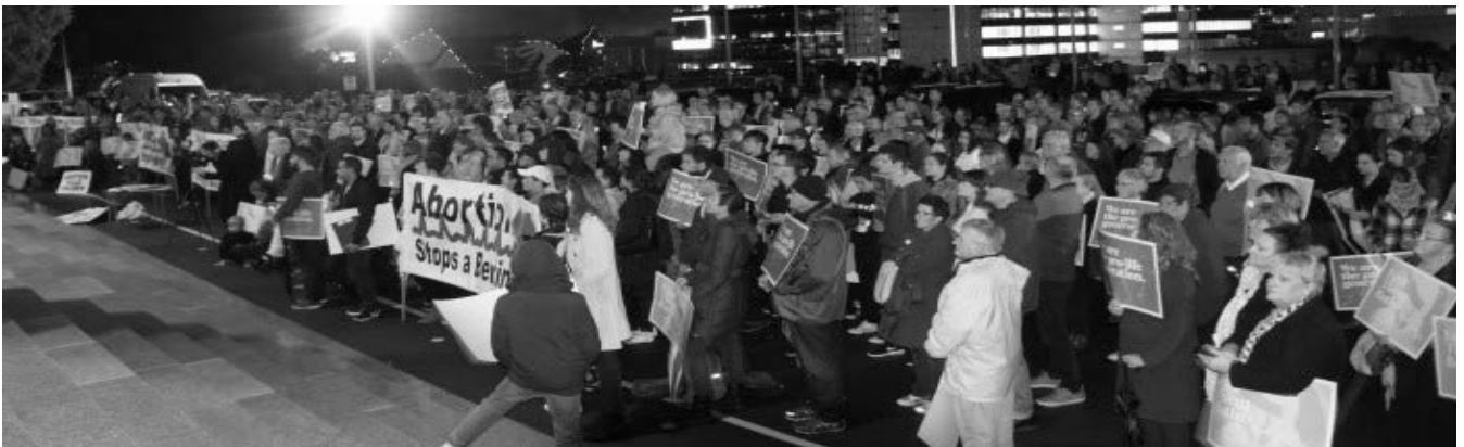
Some of the 1500+ attendees at last year's Rally for Life. Can we increase the numbers again this year?

display of crosses. This will also be located in the Supreme Court Gardens from Friday May 25 to Sunday May 27. The intention of this display is to bring greater awareness to the sheer scale of the tragedy of abortion in this state.